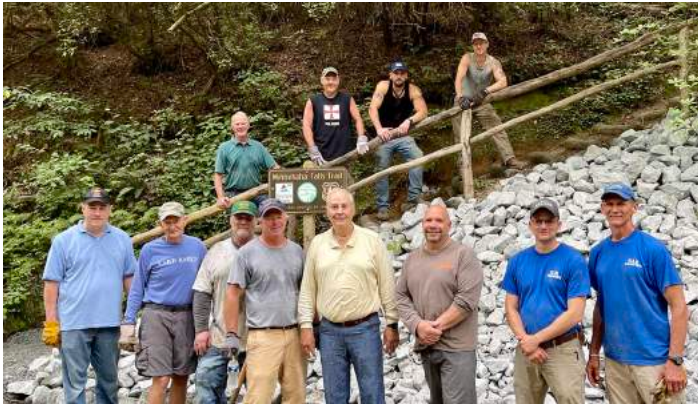
Minnehaha Trail cleanup