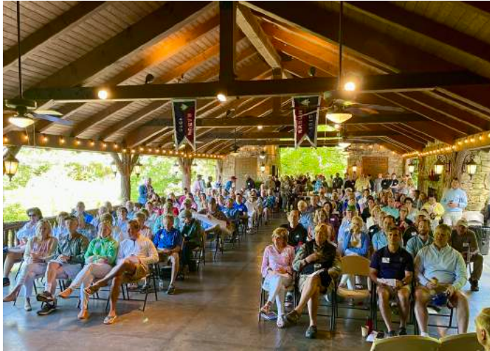
Memorial Day meeting