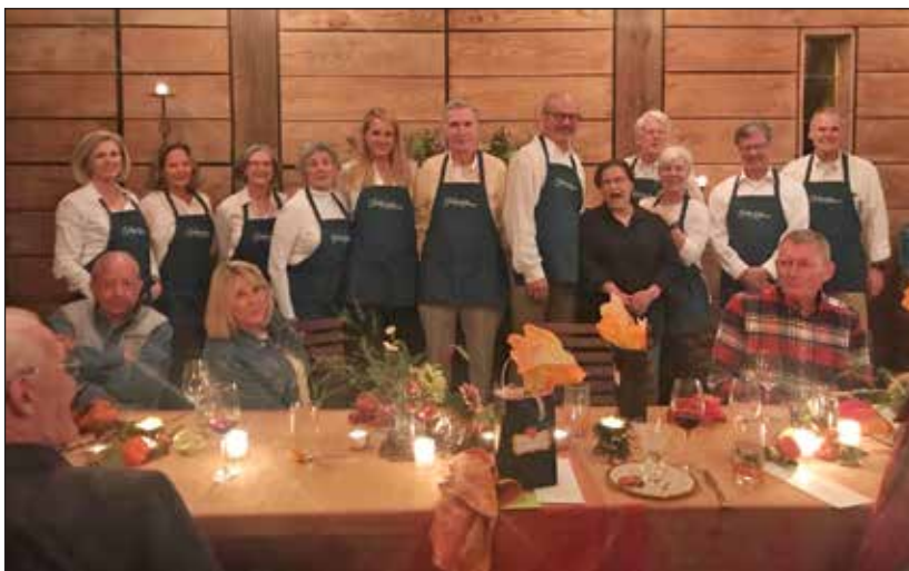
Guests and chefs enjoying themselves at the Cookbook Editors' Choice Dinner from the Local on the Lake Auction in June.