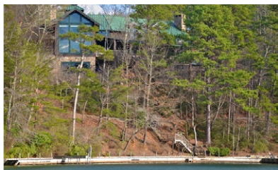
Lance & Sonja Cooper