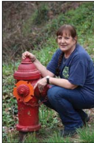
Reflective Mark-A-Hydrant will improve response times.