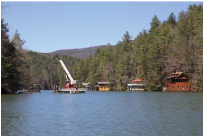
Georgia Power Company moves a crane down the lake to help with work on Mathis Dam.