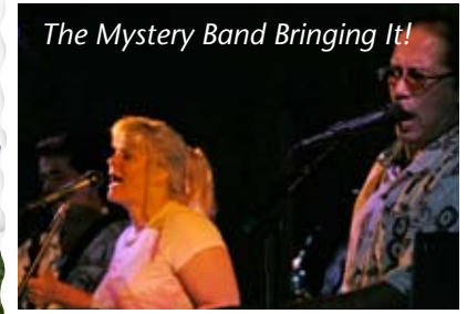
The Mystery Band Bringing It!

So what did we do on the Lake in the B.P. era (you know...Before Pavilion)? Our beautiful gathering place has already become the home to a plethora of great Lake Rabun memories. This past summer, we kicked off a Pavilion Party season with some events that are sure to become ingrained in our Lake traditions.