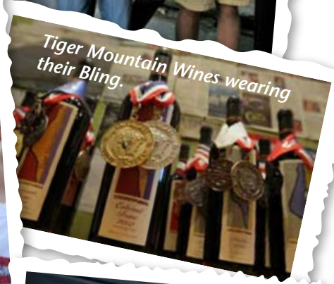
Tiger Mountain Wines wearing their Bling.