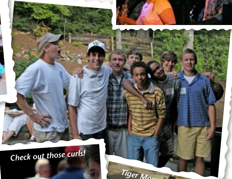
Teens actually seen – and photographed – at party with parents. Alert the media!