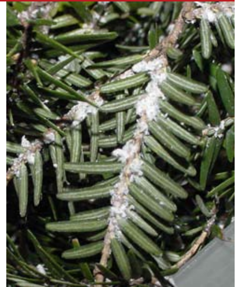
The Hemlock Woolly Adelgid sucking the sap out of a tree.