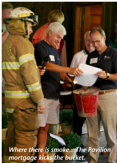
Where there is smoke...The Pavilion mortgage kicks the bucket.