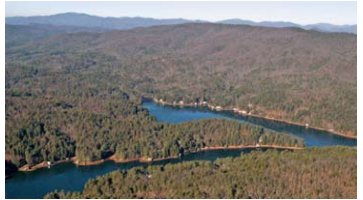
Lake Rabun during a drawdown a few years ago. It was cancelled this year to insure our lake doesn't look like this in the summer.

This may be an inconvenience for those of us hoping to take advantage of the low water to do some needed shore chores and improvements. But I am sure you would agree it is better to delay some work on your boathouse – than have it landlocked this summer!